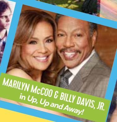
MARILYN McCOO & BILLY DAVIS, JR. in Up, Up and Away!