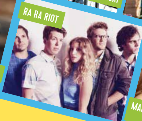
RA RA RIOT